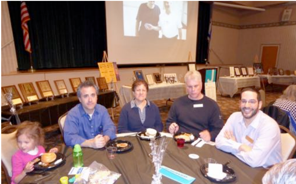
Jewish Federation Agencies Presidents & Executive Directors